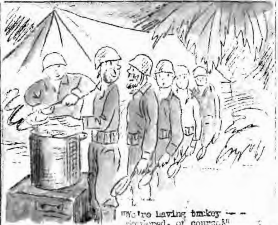
"We're having turkey -- powdered, of course!"

Propaganda Minister Goebbels recently invited all German mobs to lynch downed Allied airmen. "It is too much to ask of us that we call out German soldiers to protect the murderers of children from the righteous anger of their parents..."